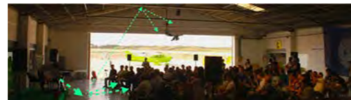
Figure 6. Performance of the piece “Jeux de l’Espace” in Santa Cruz airfield (Aeroclube de Torres Vedras); 25 th June 2015; schema exemplifying reflective operations , in this case, pointing the PLA to the floor. Photo: [44]

4) compose moments of independent spatialization of both systems; such as PLA solos than can be arranged in different ways with different degrees of elucidating the listener to the on going spatial processes: to play the PLA as a soloist (as if it was an instrument playing with an orchestra) with direct operations while operating the octophony in a more detached way from the PLA; use PLA solos (without octophony) using mainly reflective operations and punctually direct operations .